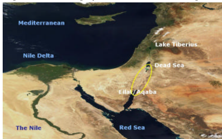
Figure 1: Satellite image of the Dead Sea and surrounding areas

Until recently, tourism and recreation made a major contribution to the economy of the region. The Dead Sea and its shoreline support a significant health industry. Additionally, potash mining and processing (and related chemicals) are major industries on both sides of the Sea.