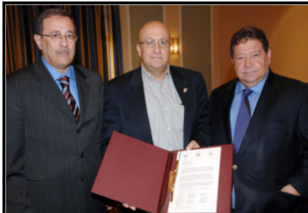
Figure 3: May 2005 World Economic Forum – Dead Sea

Beneficiary Parties jointly and publicly announced their agreement at the World Economic Forum – Dead Sea in May 2005 (see Figure 3).