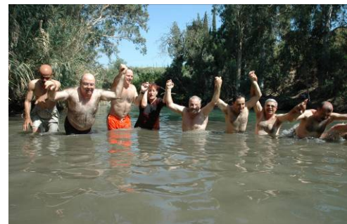
Jordanian, Palestinian and Israeli Mayors Jumping into the Jordan, July 2005

Jordanian Ministry of Planning, Israeli Foreign Ministry, Palestinian Water Authority.